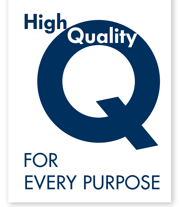
polished profiles ...